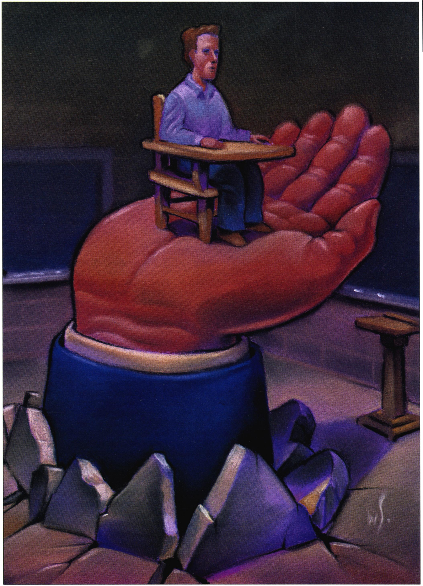
ILLUSTRATION BY WALTER STANFORD